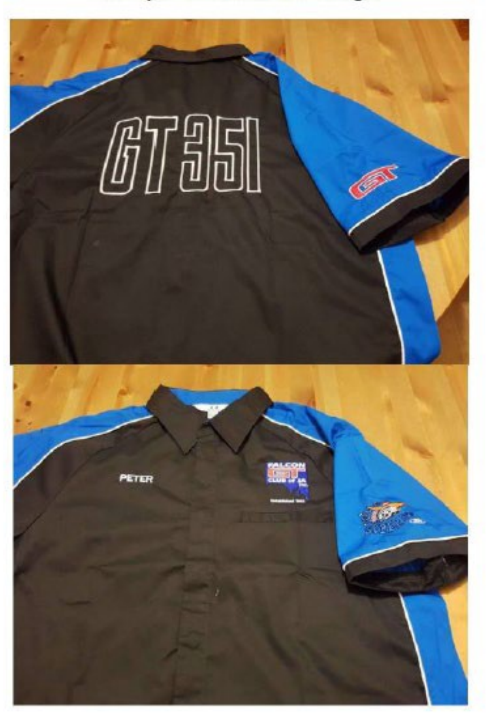
Example shows XBGT badges

You have the option to add "your" falcon GT badges to the r/h sleeve and back.