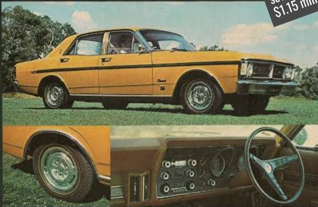
(Illustrated: Fairmont Sedan with G.S. Rally Pack)

Ford Falcon GTHO Phase III sets new auction record: $1.15 million